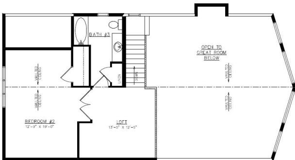
Second Floor: 638 sq.ft.

Appliances are available from Jensen - Akins Appliance.